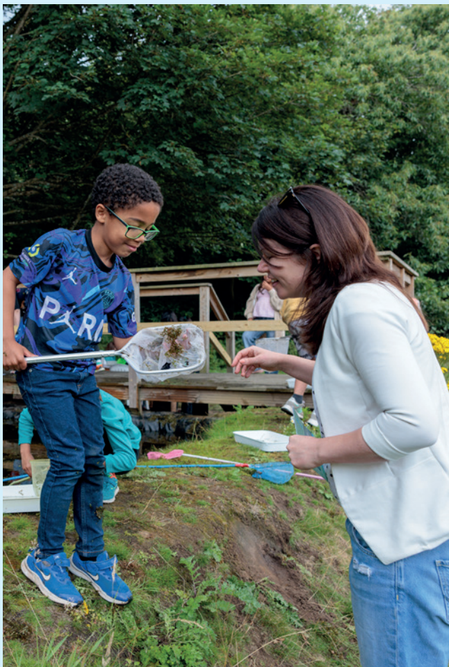
The annual Bugs, Birds and Beasts Day returned to Imperial's Silwood Park campus on 25 July.