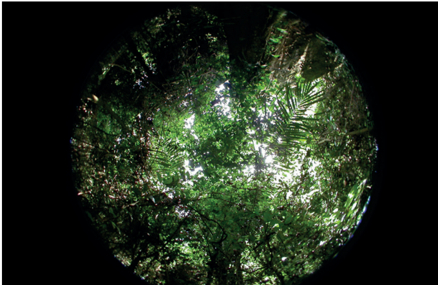
Hemispherical photograph of the tree canopy at a tropical rain forest site in Ghana. Here, and probably in many such ecosystems, the standard satellite data products underestimate the density of the tree cover (used by models to calculate primary production) because there is 100% cloud cover every day.

The magnitude of the CO 2 fertilization effect on terrestrial photosynthesis is uncertain because it is not directly observed and is subject to confounding effects of climatic variability. Professor Colin Prentice and colleagues applied three well-established eco-evolutionary optimality theories of gas exchange and photosynthesis, constraining the main processes of CO 2 fertilization using measurable variables. Using this framework, they provided robust observationally inferred evidence that a strong CO 2 fertilization effect was detectable in globally distributed eddy covariance networks. Applying their method to upscale photosynthesis globally, they found that the magnitude of the CO 2 fertilization effect was comparable to its in situ counterpart but highlighted the potential for substantial underestimation of this effect in tropical forests for many reflectance-based satellite photosynthesis products.