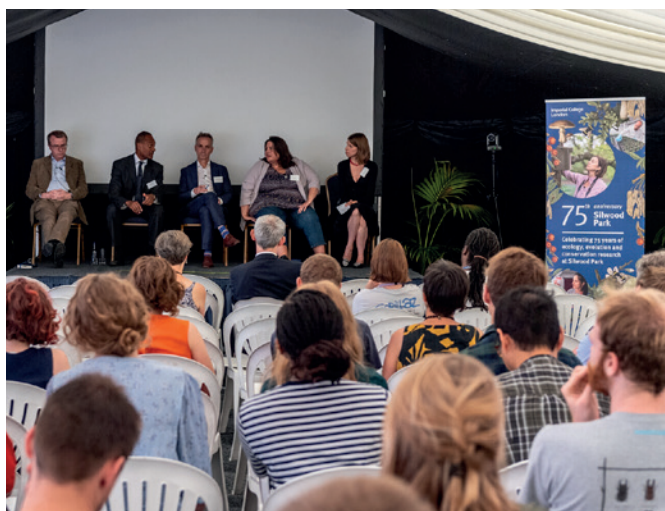
Panel discussion at the Silwood 75th Anniversary alumni event.