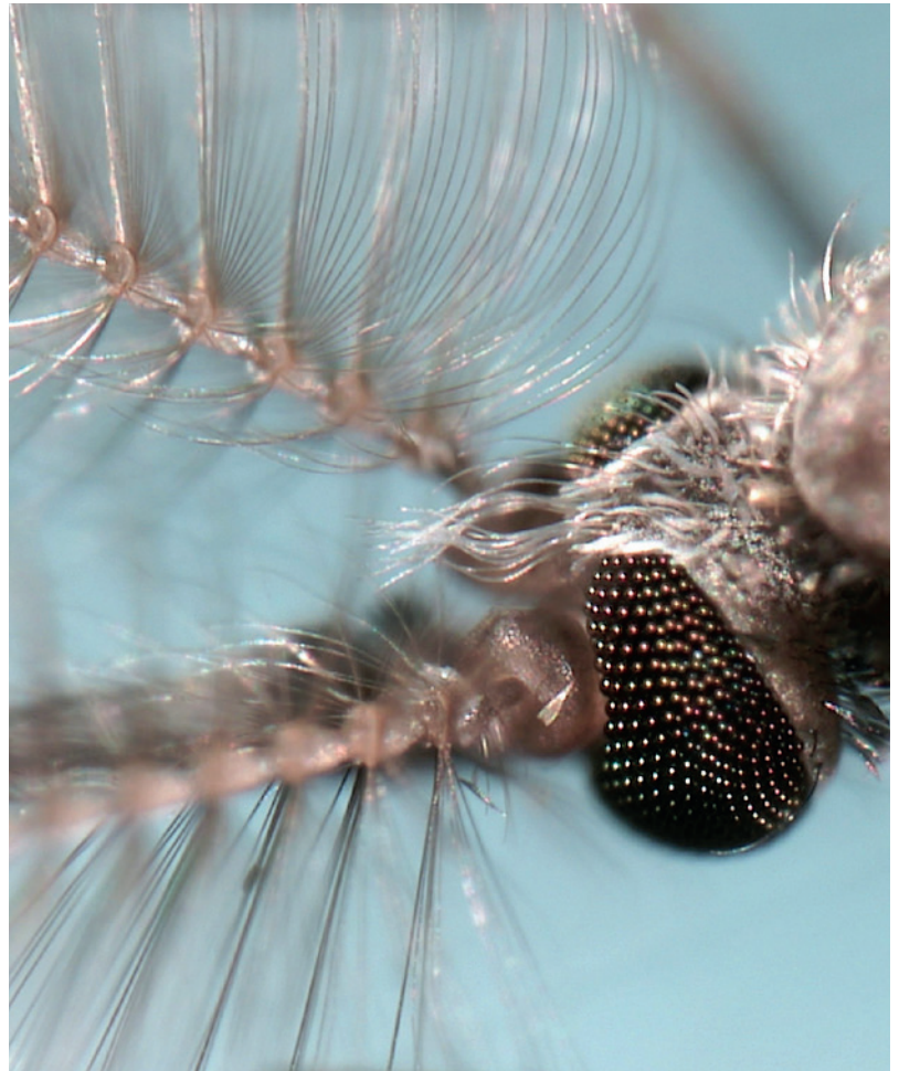
Close-up of an Anopheles mosquito