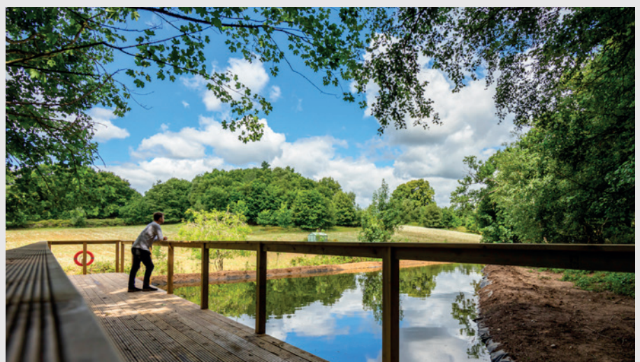
Silwood Park Campus © Dan Weill.

experiment has been a key resource to form a new generation of scientists, through undergraduate and graduate courses and student final research projects. In 2022 alone, three of the six scientific publications that resulted from work in Silwood Park field experiments studied the Nash's Field plots, showing the continued relevance of the experiment today.