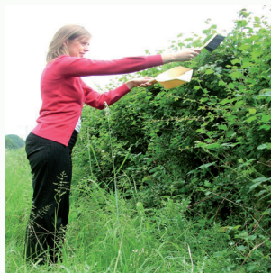
Method 2: Using a dustpan and brush

If you are not sure of an identification, post a photograph to www.ispotnature.org and someone will help you to identify it.