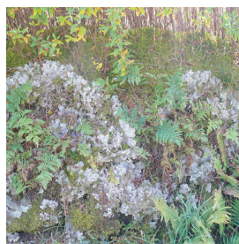
A clawdd (hedge bank), Snowdonia

Hedges are rows of bushy shrubs or low trees and are a familiar part of our countryside, acting as field boundaries. Many of these hedges are hundreds of years old; some are older than our most historic buildings. Hedges are also found in towns and cities, where they surround gardens, schools and parks. As well as acting as boundaries and barriers, hedges are important habitats for a wide variety of animals and plants. They form a valuable refuge for some of the plants and animals which thrived in the woodland that once covered most of the UK. In many areas, this wildlife is increasingly dependent on hedges for survival.