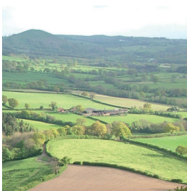
Field boundary hedges, Shropshire