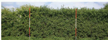
Marking out the start and end of the 3m stretch

Choose a 3 metre stretch of hedge that is representative of the whole hedge. Mark out the start and end of the 3 metre stretch before you start.