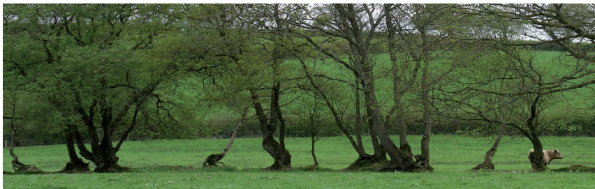
This line of trees was originally planted as a hedge

Many hedges were originally planted as barriers to contain livestock. Others were planted to mark boundaries, such as the edges of a parish, or to fulfil Parliamentary Enclosure Acts. These were Acts of Parliament passed around 150-250 years ago setting out the boundaries of private land. Many specified what the boundary should be marked with, usually a planted hedge or drystone wall.