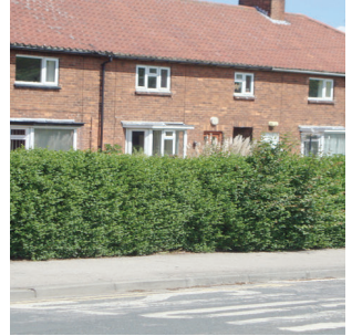
A dense hedge of privet, with good cover for wildlife but few berries, Manchester

The activities in the OPAL Biodiversity Survey tell us about the importance of hedges for wildlife. A national survey like this has not been done before so your results will help us find out more about hedges throughout the UK. You may have collected information from a hedge that has never been investigated before, especially if it is in an urban area.