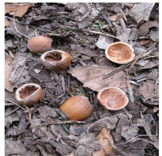
Hazelnuts gnawed by red squirrels, at the base of a hedge in Co. Fermanagh

Activity 3 shows what invertebrates are living in the hedge. The invertebrates you find can be a food source for birds, mammals and other invertebrates. Although we have chosen the most common types of invertebrate found when sampling a hedge, it is possible you will find many creatures that are not in our guide. For more help with identification, use iSpot www.ispotnature.org .