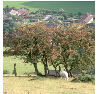
A neglected hawthorn hedge, with a good supply of berries but limited cover for wildlife, Mid Wales

Activity 1 is designed to collect information about the size, location, surroundings and management of each hedge. A score will be calculated from your results to show the condition of the hedge. For wildlife, the ideal is a continuous, dense hedge of bushes with occasional trees. The bushes provide cover and food for small birds, mammals and invertebrates; while the trees provide nesting sites for larger birds and protection for a range of invertebrates. Hedges which are cut too often, or not often enough, have greatly reduced leaf and berry production.