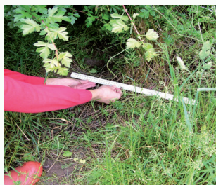
Measuring holes along the hedge

Use the tape measure in your pack to measure the size of all holes in the ground under or next to the hedge (Question 19). Only record holes that are free from leaves, stones, loose soil or other debris.