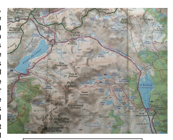
Figure 1. An exert from the IGN carte de randonnes maps.

There is a GR10 guide that we found very useful, especially for initial planning. We stuck to the guide fairly loosely though, sometimes combining shorter days or doing 1 1/2 "guidebook days" in a single day and also incorporated rest days occasionally which the guidebook omits. The Maps we used where IGN carte de randonnes 1:50,000 scale which were perfect for the trail although we sometimes struggled on the occasions we went off the trail due to smaller paths not being marked. While it is easily possible to do the trail without maps as the guidebook is quite specific and the GR10 is very well signposted we needed them on the occasion that we left the trail and they would have been useful had an accident occurred.