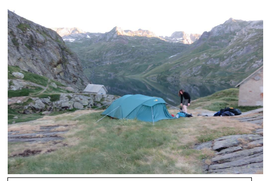
Above: Two huts, one locked and one nearly destroyed inside. Good job we packed the tent.

Due to us sleeping in a cabin far from a water source and because we'd decided on porridge for breakfast, we had to go without food until we reached a stream where we had a hurried breakfast surrounded by mist and sheep. However, towards midday the weather started to clear up and we saw some of the views we had been promised. When the sun came out though we realised how hot the Pyrenees can get with the sun beating down on your back. We also realised we may have been slightly short on food when we shopped in Toulouse but fortunately we found a restaurant able to supply us with some snacks. After lunch we had a lot of uphill to do in the heat of the day which we found exhausting and realised getting uphill out of the way early in the day is the way to go, but we looked forward to the nice cabin at the end of the day. Excitement spread through the group at the sight of the mountain hut next to a lake (a lake that David proceeded to take a, rather chilly, dip in). Unfortunately we learnt a further life lesson in that not all French cabins have mattresses or are even safe from collapsing so we decided to camp instead of risking the dangers of said cabin.