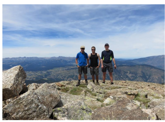
Above: The group (minus Lizzie) reached a 2667m peak

also happened to be infested with insects and was considerably worse smelling than us. To finish off the day we crossed the nearby stream and camped just outside of range of the sign saying we couldn't camp