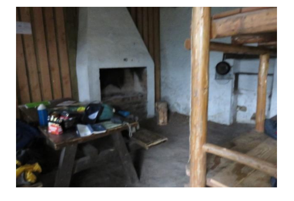
DAY 26: 30th July 2015