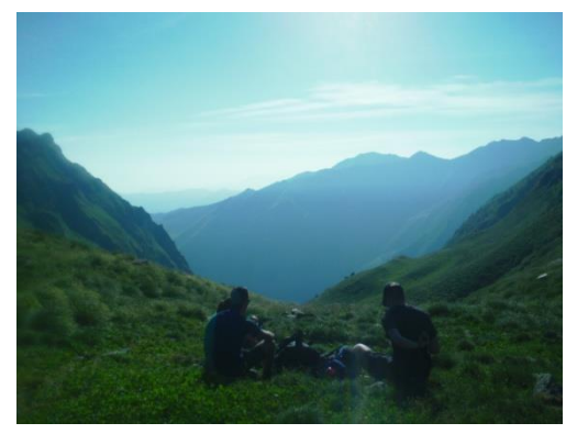
Above: One of many fantastic views we enjoyed after an ascent

After waking up to find mice had been at our bags and managed to find oats and Tom's cuppa soup, the breakfast portions were disappointingly small. Nonetheless we started the day with a steep hill, soon followed by a long, equally steep, descent. Upon arriving at our lunch stop it was soon discovered that a cafe was selling cornettos for €1 and so most of the group had 2! The path now became a popular tourist walk leading up to Lac d'Oo. We continued up past the Lake towards the refuge where, after finding no suitable places to camp, we decided to stay the night.