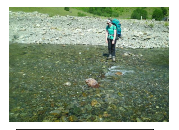
Above: Lizzie was not impressed by our choice of route