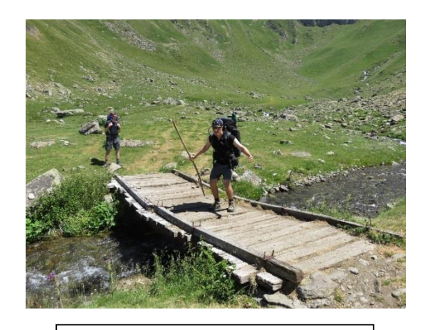
Above: I thought the troll is supposed to be under the bridge...?