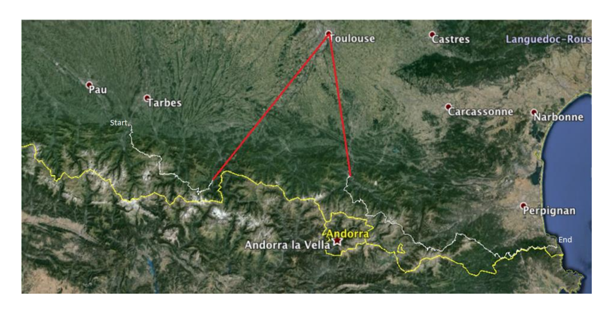
Figure 2. Map showing the final route, yellow lines are borders, white lines represent the actual route hiked and the red line represents public transport (via train)