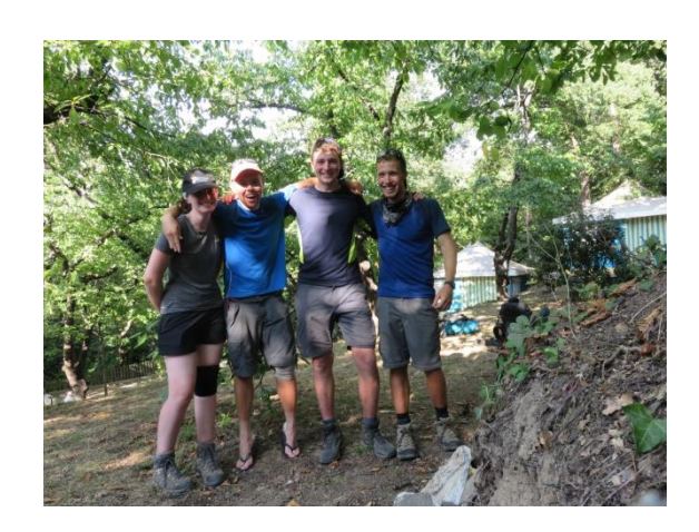
Above: We all quickly found out just how sweaty our backs were