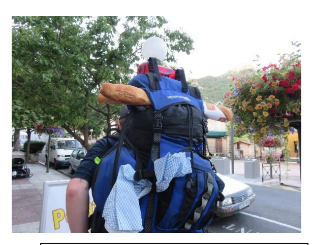
Above: Putting the 'bag' in baguette

start of the trip, our fitness levels had very noticeably increased by this point. We finished the ascent and arrived at our first choice of huts in the early afternoon. However, despite the modern and comfortable exterior it turned out that the hut was heavily infested with bedbugs so we decided to move on. The next hut was only a 40 minute walk further on so we had a short rest outside this hut first. We arrived at Hut l'Estangol around four in the afternoon and proceeded to become very bored as everyone had finished their books, phone batteries were dead and there was no sun to allow for charging. To top everything off we had pretty much run out of gas!! But this did lead to the very exciting prospect of cooking on an open fire in the available fire pit. Although Tom wasn't happy at the blackened state of his pan afterwards.