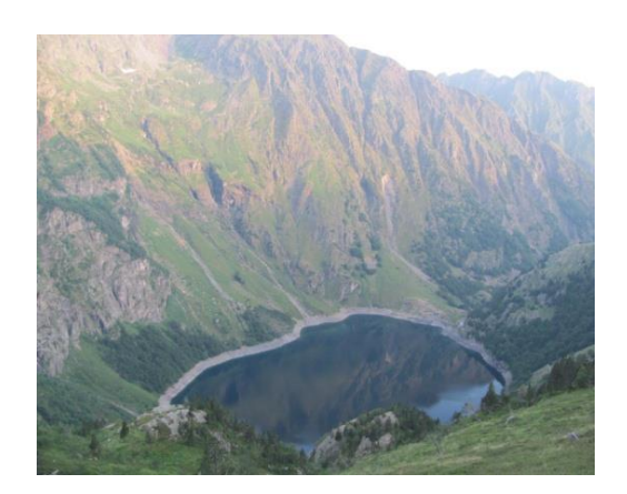
Above: Lac d'Oo