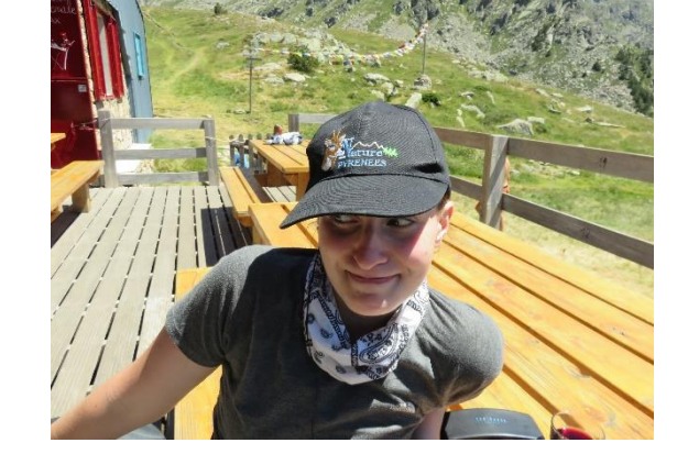
DAY 20: 24th July 2015