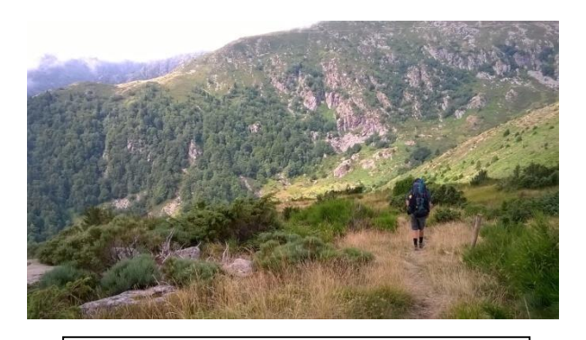
Above: It certainly didn't feel like higher than the top of Snowdon