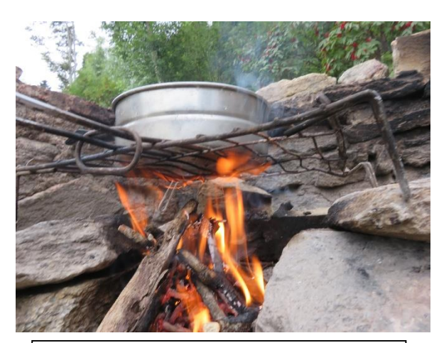
Above: We never thought running out of gas would be so much fun