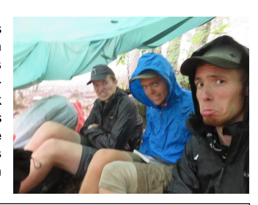
Above: We could only avoid the rain for so long

The start of the day was one of the most boring parts of the trail that we saw. It was just flat and misty with no views and little excitement in the terrain which was road for a good fraction of the day. We arrived in Auxles-thermes all ready to resupply on gas and get back to hot meals but alas they only stocked the clic-on gas as opposed to the twist on gas and we learnt the valuable lesson of if you're going to take two gas stoves, take different types. As such we stocked up on