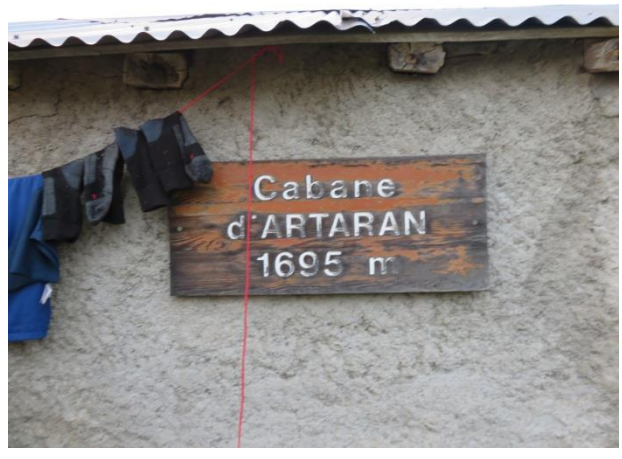
Above: A carefully deployed washing line added a homely touch to the cabin