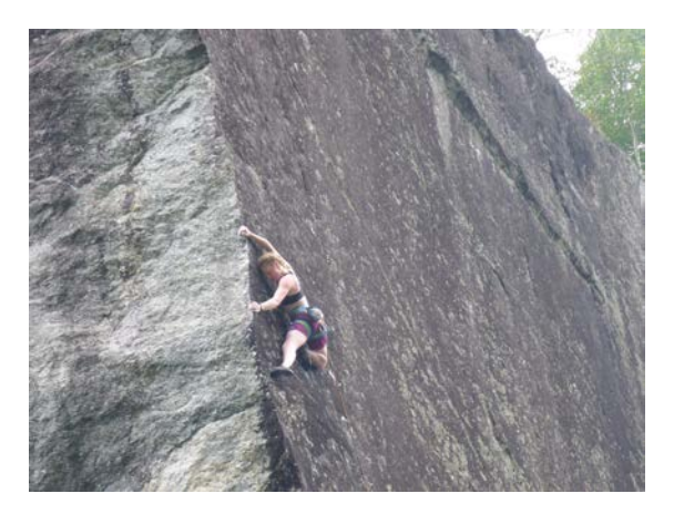
Fighting with the aréte

I now live and work in Surrey, but regularly drive into London to climb at the Westway climbing centre, and so intend to stay an active member of ICMC as much as I can, including taking part in weekend trips and tours. I would also love to run one last expedition next summer, whereby I can pass on the big-walling skills I have gained over the last few years to other members of the club.