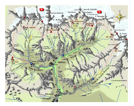
Province of Sondrio