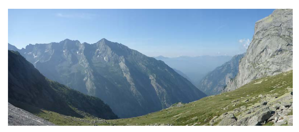
The surroundings were beautifully peaceful at the base of Quote Rosa

Quote Rosa, a fairly recent route established in 2012, is at the far end of the Monte Qualido peak. Nearly all of the routes up Qualido are round 500-900m in length, with a combination of hard trad/sport and aid climbing. The routes are generally quite committing and parts of the wall have, over the past 15 years, considerably changed due rock fall. Quote Rosa is the easiest and least committing routes up the Qualido face, described as the only 'via plaisir' (i.e. fun and non-committing) on the wall.