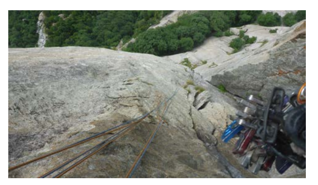
Some of the fantastic crack pitches

The rest of the route was supposed to be really easy runout slabs. Most were fairly easy with 50-55m runouts, except I went off-route without the right gear and ended up on a slightly scary very runout offwidth, which I climbed by jamming one knee inside to avoid falling. I thankfully made it to the top without any falls feeling happy to be in one piece. After much pulling through grass and spikey plants we eventually reached the top. A short celebration of fruit buns and water, then we began the 16 abseils to get back down. We had a few sketchy abseil anchors consisting of one bolt, but eventually reached the valley floor. Another 30-40 minutes of walking and we were back at camp feeling exhausted but happy with the onsight achievement. I