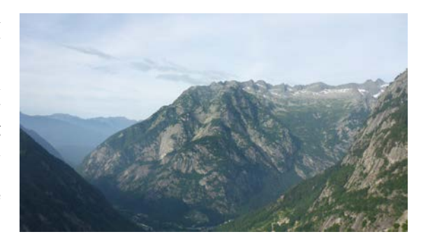
View from the the climb

The rest of the route was supposed to be really easy runout slabs. Most were fairly easy with 50-55m runouts, except I went off-route without the right gear and ended up on a slightly scary very runout offwidth, which I climbed by jamming one knee inside to avoid falling. I thankfully made it to the top without any falls feeling happy to be in one piece. After much pulling through grass and spikey plants we eventually reached the top. A short celebration of fruit buns and water, then we began the 16 abseils to get back down. We had a few sketchy abseil anchors consisting of one bolt, but eventually reached the valley floor. Another 30-40 minutes of walking and we were back at camp feeling exhausted but happy with the onsight achievement. I