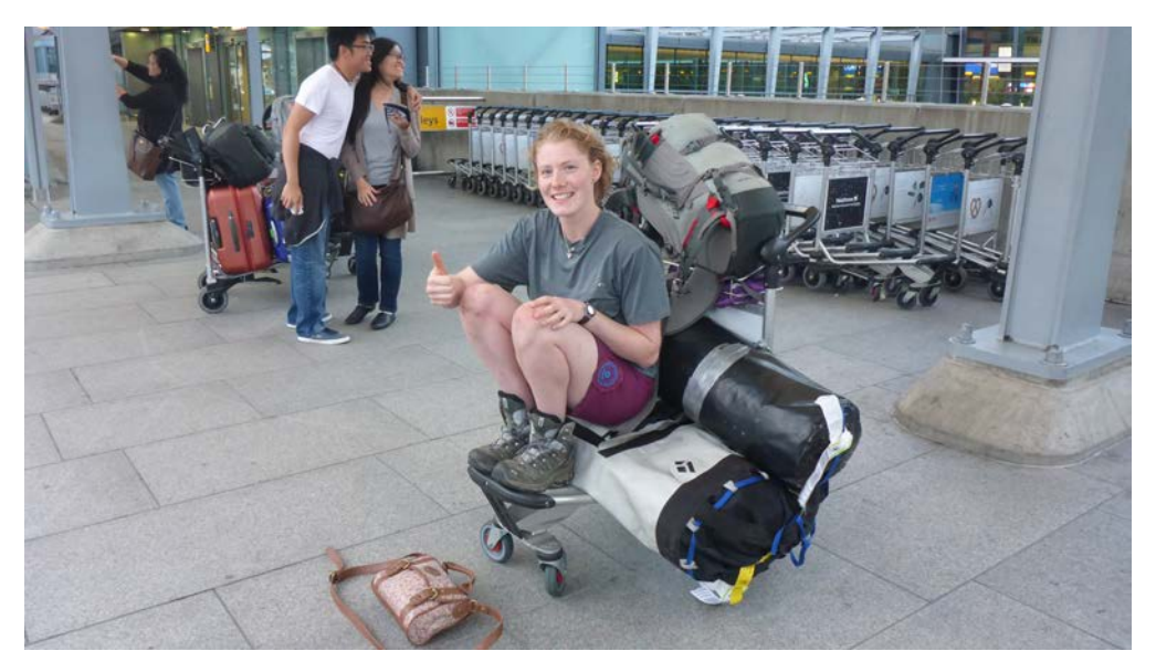
Arrived back safely in the UK

Camping: £150 Food: £200 Insurance: £99.52 This totals £711.62.