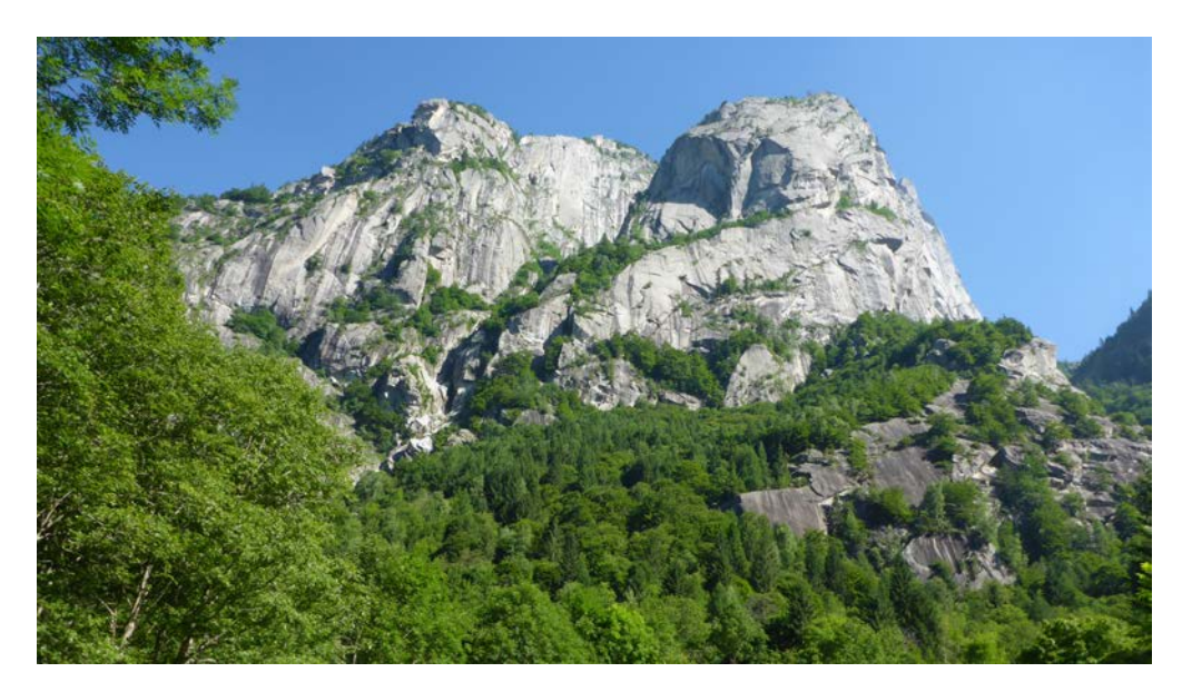
View of Oceana from the campsite

Oceana Irrazionale is one of those iconic routes of the valley that just begs to be climb. Visible from the campsite, the route follows a series of crack climbs that lead up to the crux roof pitch, and then onto the slabs above to finish. The approach in itself is not completely trivial, taking a windy steep trail that, after heavy rainfall, becomes a torrential waterfall. There are several fixed ropes of dubious condition to help on the steeper sections. The trail eventually leads up to a slanted ledge that marks the start of all of the routes. Along this ledge is a cave that seems almost too well designed for bivvying in, with several flat platforms to sleep on and a rope strung up to clip gear/bags to.