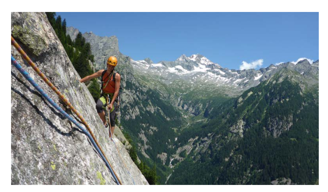
Seriously stunning views from the routes