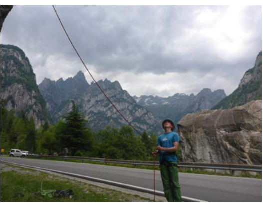
Atmospheric scenery