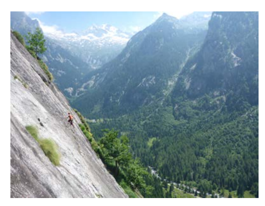
Climbing in Val di mello gives stunning views