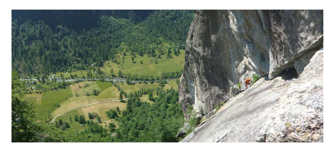
Series of amazing crack climbs up Kundalini

After a reasonably early start we were walking to the crag by 6am. The base of the route was easy to find and we were on the wall 45 minutes later. Kundaluni is supposed to be 10 pitches, but because of rope drag we did it in 12. One of the best routes that I've climbed! It was in full sunlight though, so very hot! My feet were burning by about halfway up, especially on the slab pitches. But the route has some fantastic varied pitches, including epic crack climbs, a chimney, and a funky slab. We both got back down feeling knackered after being on the wall till about 4pm and not eating much. We went straight to the lake and enjoyed an evening swim, and then head to the nearby bar for dinner.