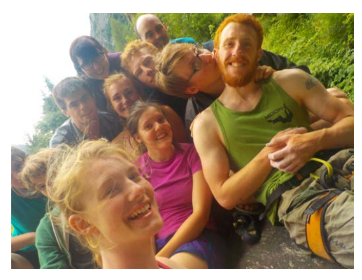
Some of the Glasgow University Mountaineering Club

Finally I would like to thank the Glasgow University Mountaineering Club for being extremely welcoming and inclusive during the two weeks that they were also at the campsite. Not only did I meet a fantastic group of people, but also climbing partners that I hope to meet up with again when I can visit Scotland next!