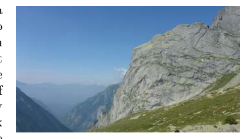
The chossy vegetated route

We woke up at 4.50. After a slow start, we were walking by about 6 AM. The walk up to Quote Rosa wasn't trivial by any means. There was no path so we followed the Rocky River for some of the way, then lumpy unpredictable grass and some wet slabs. About one hour later we arrived at the base of the route. The line was very indistinct, and followed several ledges of vegetation. Although the guidebook stated that every belay was bolted, we didn't see a single bolt. The rock also looked super chossy. After some consideration we agreed that neither of us was psyched to climb it. Run out chos? No thanks. Both exhausted, we fell asleep at