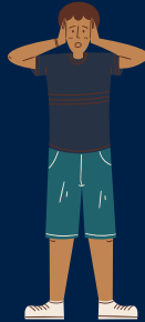
Feel pressured to excel in my field

Focus on your own progress, do not compare to others