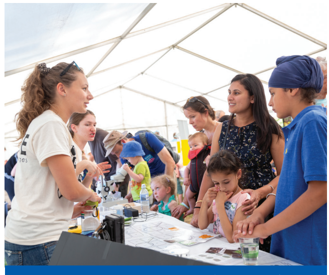
Environment DNA experiments in the Marquee.