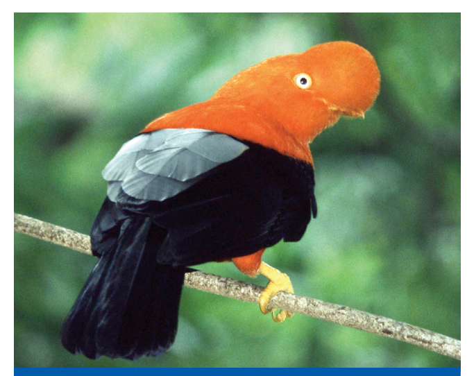
Bird assemblages, including the Andean Cock-of-the-Rock, were used to assess the benefits of different farming practices on biodiversity.