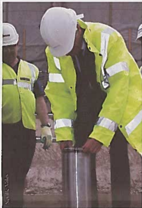
The Rector sealed a time capsule that won't see the light of day again for 100 years at this month's 'bottoming out' ceremony at the new Southside halls of residence.

The event was marked with the sealing of a time capsule that will be embedded in