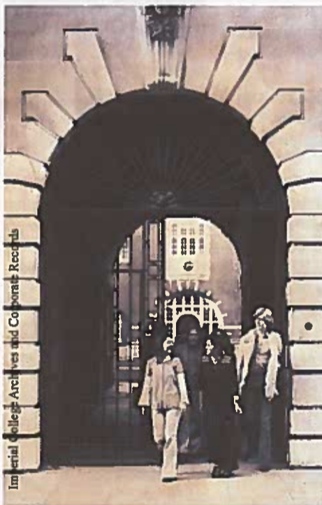
Will these Imperial students leaving Beit Quad in 1973 return for the first alumni reunion?

① For more information about the 2006 Alumni Reunion visit www.imperial.ac.uk/alumni/events/reunions .