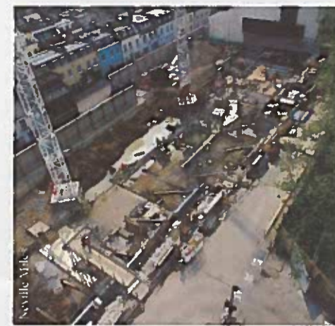
Visit the Prince's Gardens restoration page on Spectrum to follow the progress of the building of the new students' halls of residence