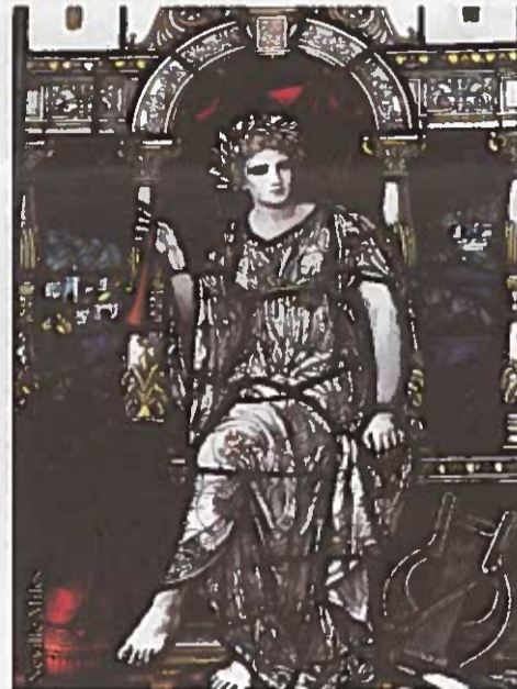
For many years, the stained glass windows in the Queen's Tower were thought to have been designed by Edward Burne-Jones