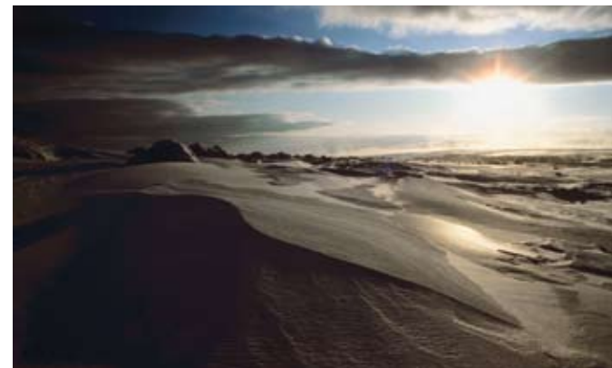
Imperial's new research centre will investigate ways of managing the effects of climate change

"We want our researchers to narrow down this margin of uncertainty and draw up a timescale for change"