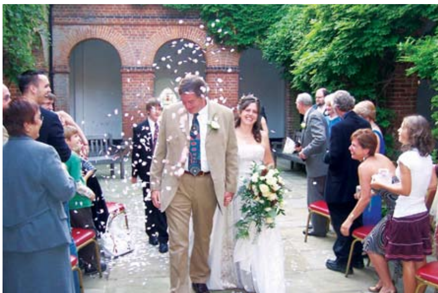
Wye Campus plays host to its first staff wedding

► To find out more about facilities for weddings and other special occasions at Wye, visit www.weddings-at-wye.com or telephone 01233 811711.