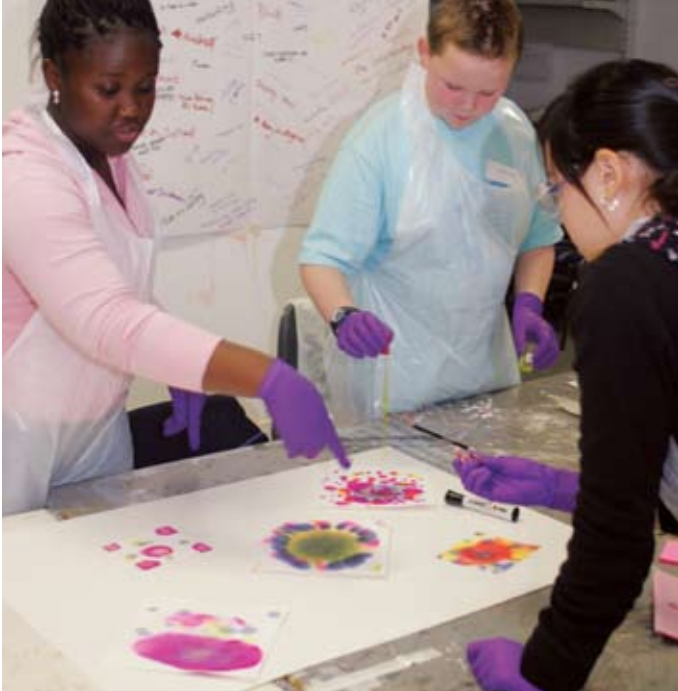
Young Londoners learn the science behind colour with Imperial's chemists