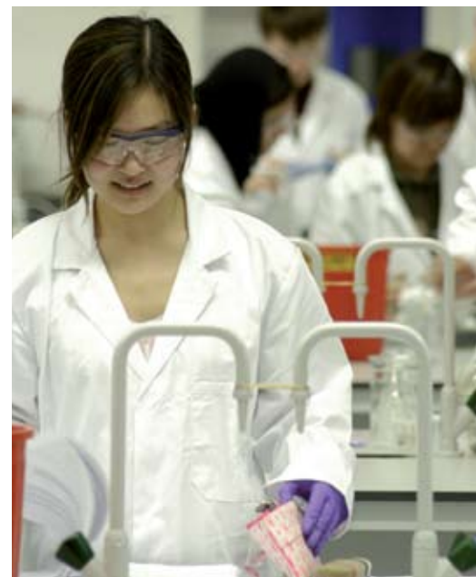
Imperial improves across the board in THES rankings