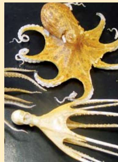
Blaschka glass models of marine animals used in teaching up until the 1900s