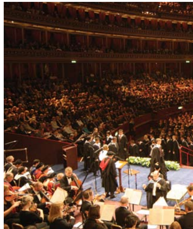
On Wednesday 25 October, the Royal Albert Hall was packed with graduating students from across the Faculties of Engineering, Medicine and Natural Sciences.