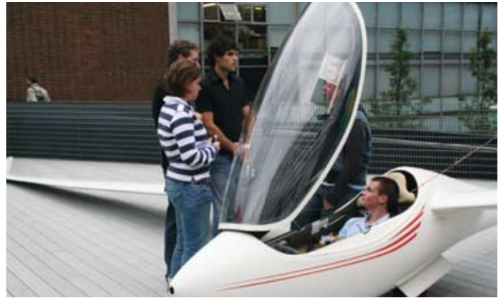
Flying high: learning to glide was one of the many things on offer at this year's Freshers' Fair

A special Centenary stand gave students the opportunity to find out more about the forthcoming Centenary celebrations. Over 400 students signed up to receive the fortnightly e-bulletin about forthcoming Imperial events and over 300 students posted Centenary postcards for free to addresses all around the world.