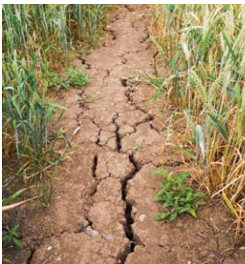
Increasing temperatures due to climate change threaten plants and wildlife

► Go to www.imperial.ac.uk/climatechange for more information.