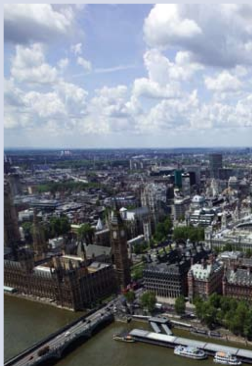
Martin's research may start small but is applied to vast areas, for example oil fields under the North Sea the size of London

Our main interest at the moment is in understanding how fluids move underground through porous rock. We are aiming to establish both the science and design processes for getting as much oil out of the earth as possible. We look at microscopic grains, but apply this to huge areas, for example, the oil fields under the North Sea that are so vast they would cover London! We're also concerned with the process of collecting carbon dioxide and injecting it underground to flush oil out. This is an incredibly important process economically as the world's demand for oil is undiminished.