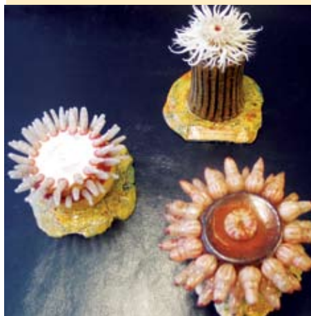
The challenge of protecting these beautiful objects increases as they become more brittle with age