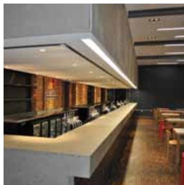
FiveSixEight bar, named after the number of millilitres in a pint. The bar has a concrete façade, and has been designed so that HD TV can be projected on to it.

The cost of the final phase of development was £2.6 million, two-thirds funded by Imperial College Union and a third by a gift from the College to help