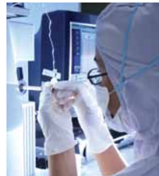
The Lectureships will provide teaching and research opportunities for early-career academics.