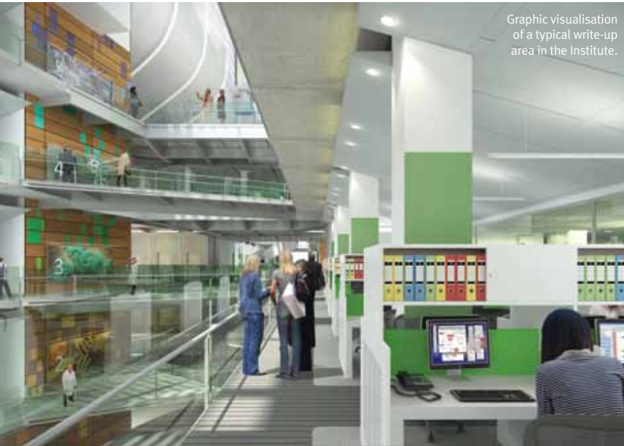
Graphic visualisation of a typical write-up area in the Institute.