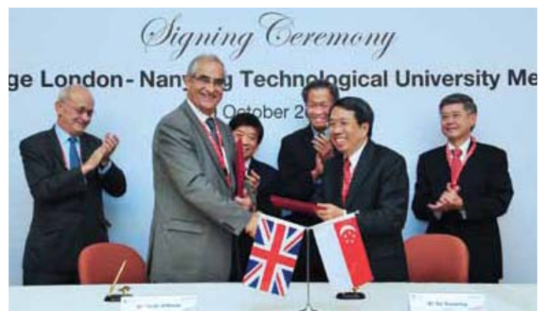
SEPTEMBER 2010 Nanyang Technological University and Imperial announce a partnership to jointly establish the Lee Kong Chian School Medicine in Singapore