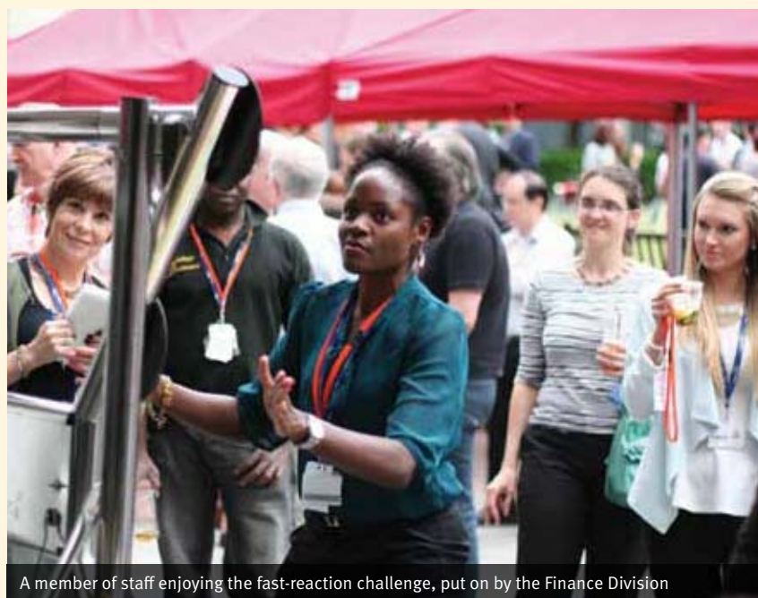
A member of staff enjoying the fast-reaction challenge, put on by the Finance Division