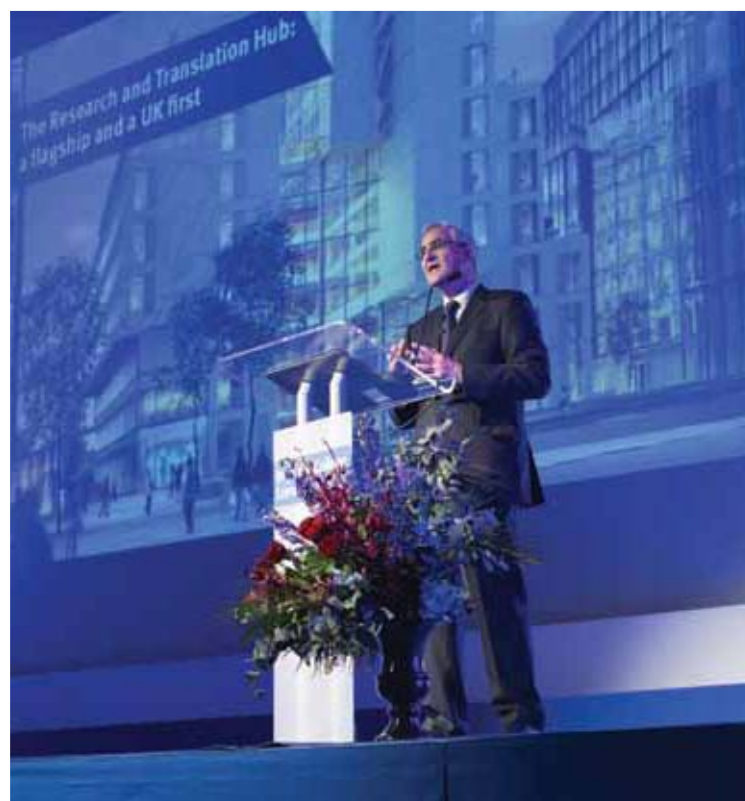
MARCH 2013 Sir Keith presents the vision for developing Imperial West into a major research and translation campus