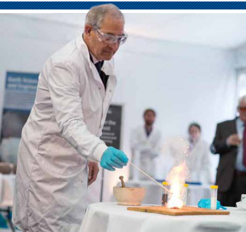
JUNE 2013 Sir Keith launches the second Imperial Festival with a bang – the event attracts more than 10,000 members of the public and alumni visitors to the South Kensington Campus