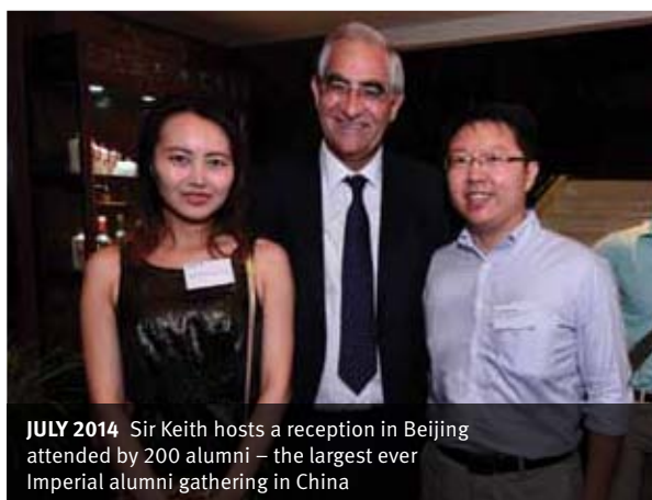
JULY 2014 Sir Keith hosts a reception in Beijing attended by 200 alumni – the largest ever Imperial alumni gathering in China