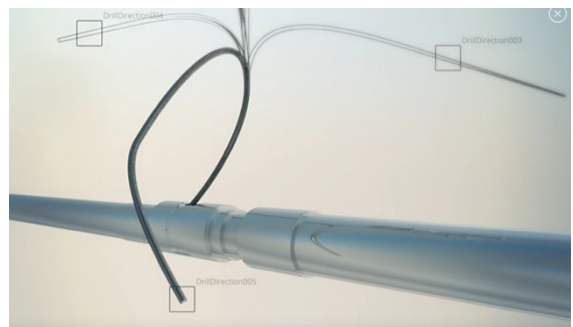
Figure 2: Enteq's multi-lateral well system having a mother bore and many laterals for increased reservoir contact.

The aim of the project is to develop a practical tool for data assimilation. A reduced order model will be developed that will run several orders of magnitude faster than a standard, forward model used to solve the governing equations. The computational speed of the ROM will enable the rapid exploration of the sensitivity of the solution to the controls (the initial conditions, and formation properties). To aid in validating the framework, data assimilation techniques will be applied which constrain the solutions to the observations.