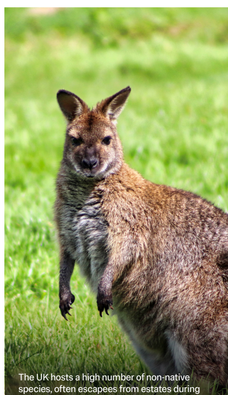
species, often escapees from estates during Victorian times, such as wallabies.