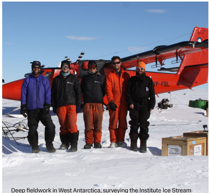
Deep fieldwork in West Antarctica, surveying the Institute Ice Stream using the British Antarctic Survey's airborne geophysical platform. Funded by NERC.