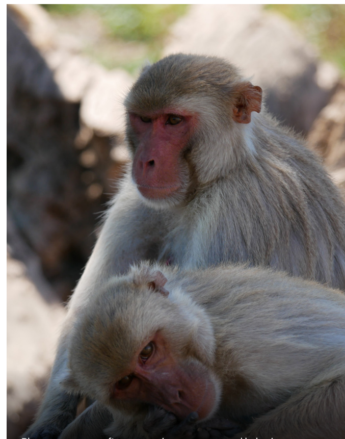
Rhesus macaques often engage in same-sex sexual behaviour among males, which likely provides advantages to their social groups.

dispersal capacity which is vulnerable to habitat fragmentation.